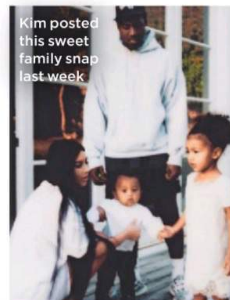
Kim posted this sweet family snap last week

"Kanye's been a shadow of his former self since his meltdown and has been very quiet and introverted. Kim wanted to show her support by joining him in Oklahoma given what a tough few months he's had, but she said they barely spoke and were civil