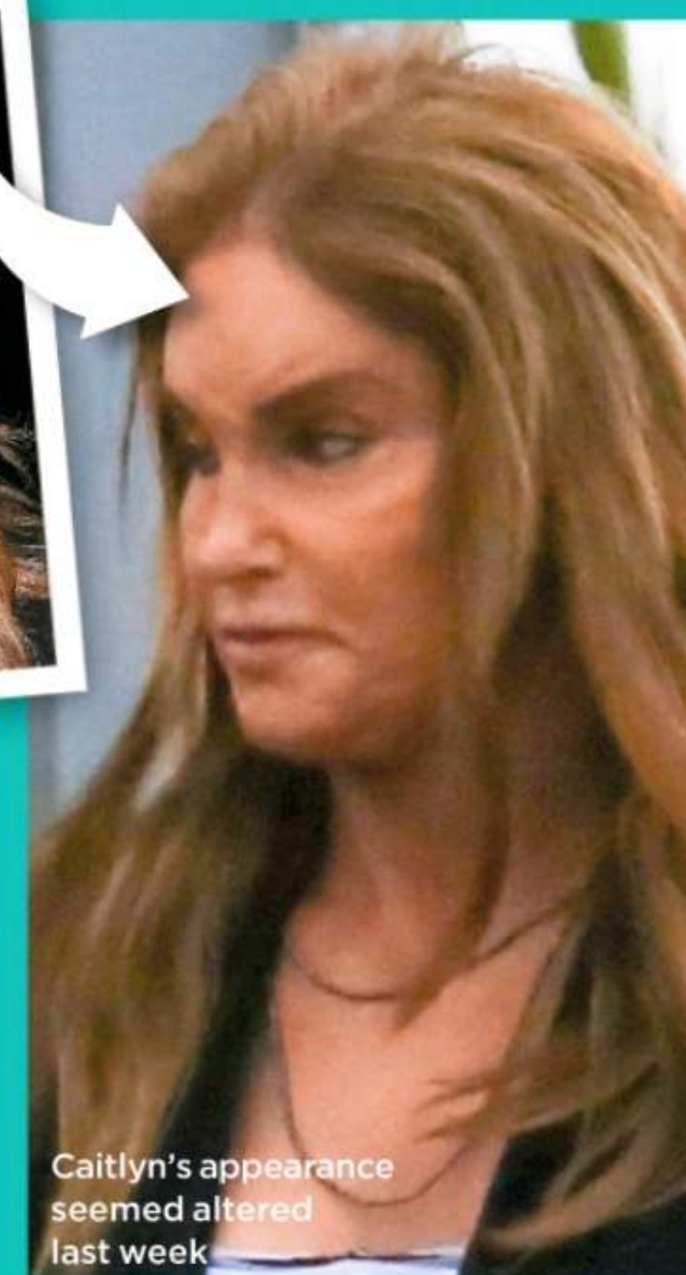
Caitlyn's appearance seemed altered last week